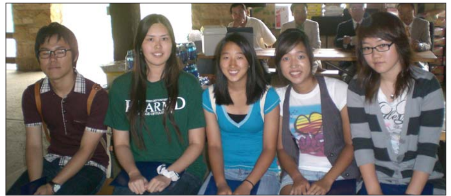
2008년도 클리블랜드 한인회 장학생들이 8월 광복절 행사장에서 장학금과 증서를 받았다

일한 경험이 있는 만큼 교육에 좀더 투자해서 한국의 문화와 언어를 우리 한국 2세 아이들이 좀더 체계적으로 접할 수 있도록 하고 싶습니다. 또 좀더 다양한 이벤트와 문화적 행사를 통해서 한국을 여러 주위사람들에게 알릴 수 있도록 하고 싶습니다.