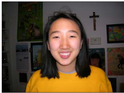
다이아나 셋별 신